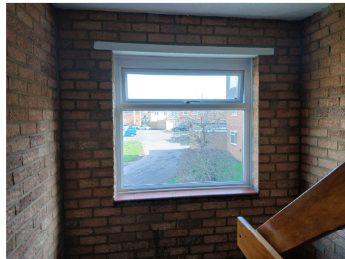
Windows (Communal Windows)