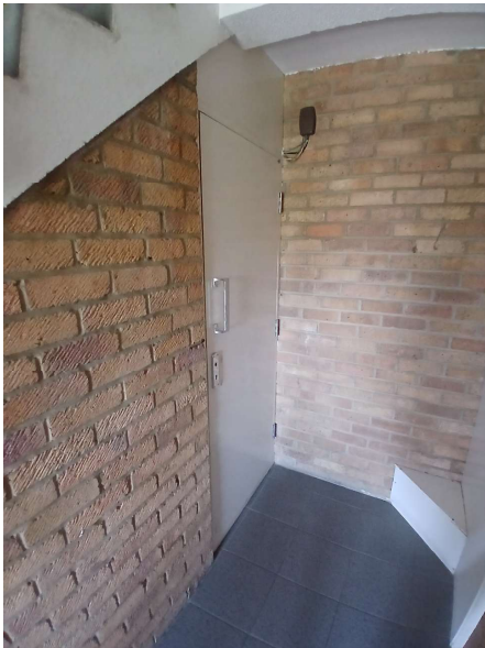
Cupboard Doors (Electrical Cupboard Doors)