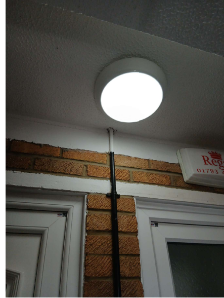
Lighting (Standard and Emergency Lights)