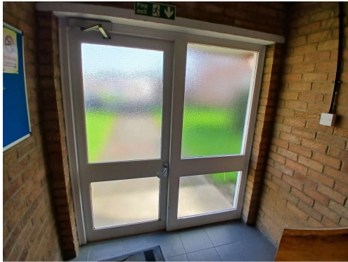
Entrances (Main Doors)